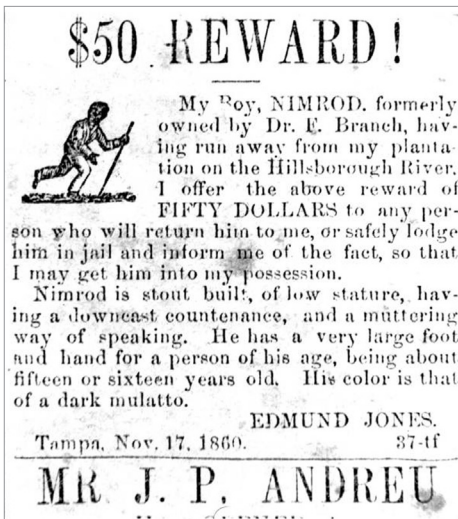
Records associated with the slave owner may reveal information about the slave, too.

and misfortune, she has by labour and industry gained the price of her freedom, which she is desirous of using in the necessary comforts of life. Your petitioners desire to be heard that they may walk and converseation in life before and since the death of her master have been such as to entitle her to the sympathy and good will of those all, and that her success in life in future life so to conduct herself and nurture her infant children, as to manifest to all that she and they are worth out